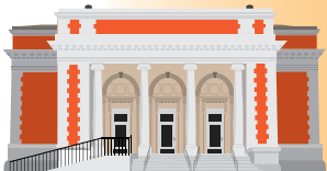
Mary Martin Hall, home of the Auburn University Career Center